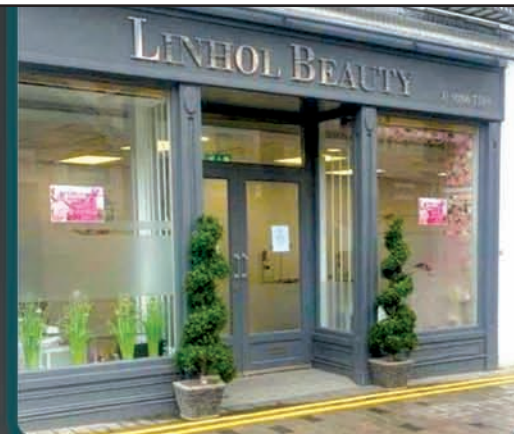
Linh Beauty Linh Health & Wellness