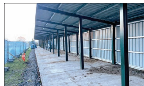
Plans are progressing well for the new driving range at Down Royal Golf Course which opens early 2026!

It will have 18 fully covered and lit bays with Trackman technology and screens in every bay.