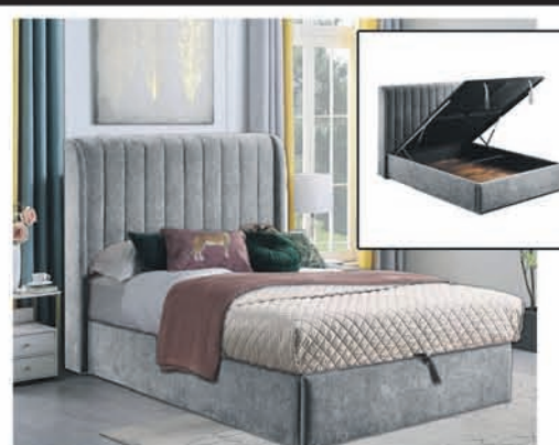
FREYA OTTOMAN DOUBLE BED WAS £699 NOW £449 FREE ASSEMBLY