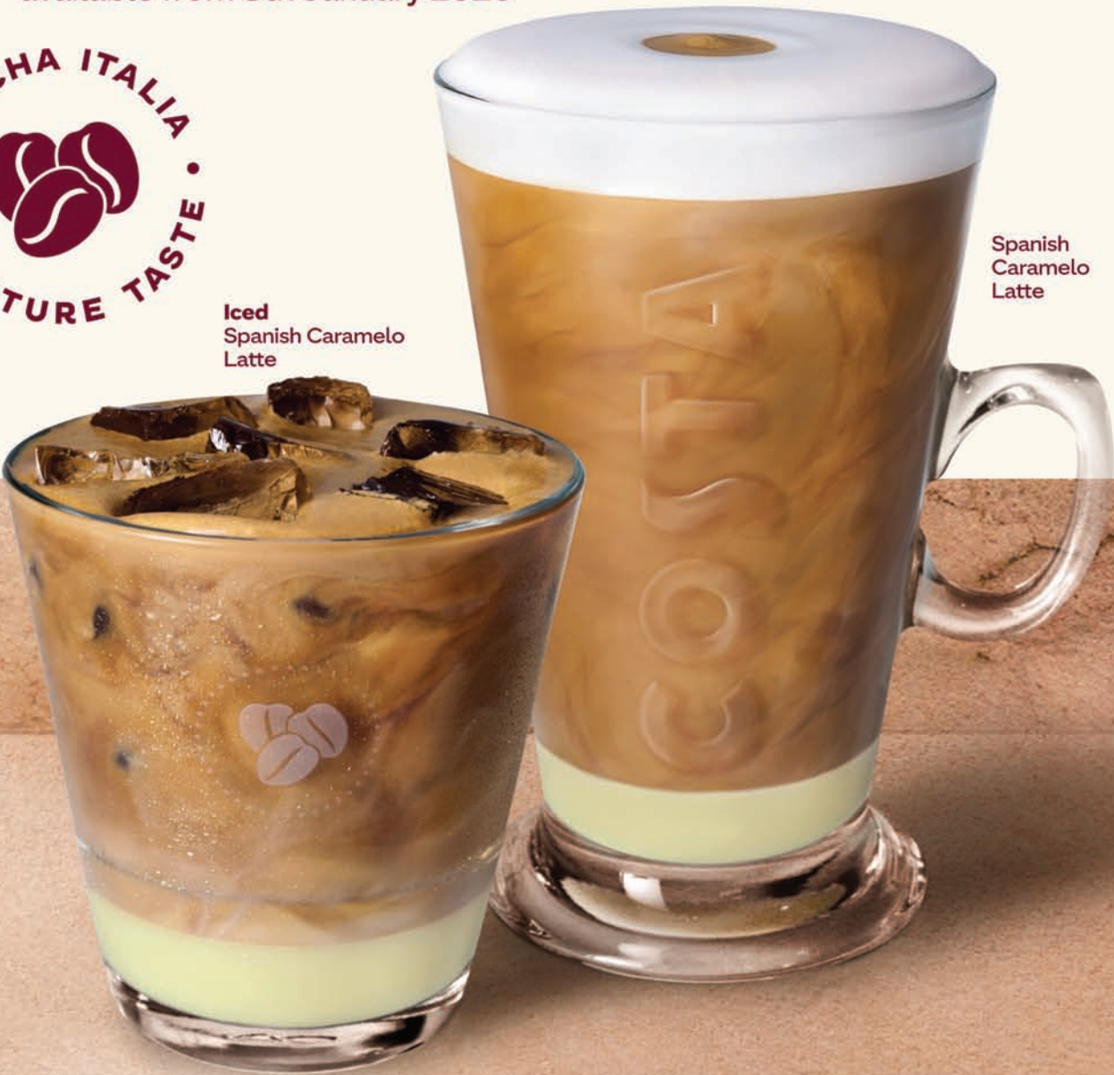
Spanish Caramelo Latte