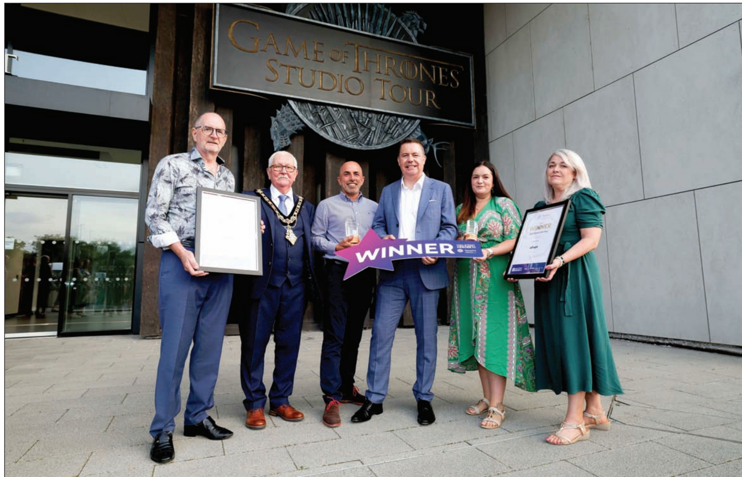
Northern Ireland's High Street Heroes 2025 Crowned at Game of Thrones Studio: Retail NI, in partnership with National Lottery operator Allwyn, SSE Airtricity and Gig Grafters, is delighted to announce the winners of the High Street Heroes 2025 Awards. The celebration event took place on Thursday 21 August at the Game of Thrones Studio, Banbridge, where finalists came together to honour this year's champions of Northern Ireland's independent retail sector