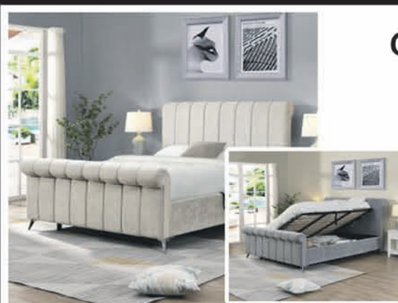
CURREN OTTOMAN DOUBLE BED RRP £1049 NOW £749 FREE ASSEMBLY