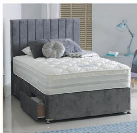
POCKET 1000 DOUBLE DIVAN WITH 2 DRAWERS AND HEADBOARD RRP £849 NOW £649