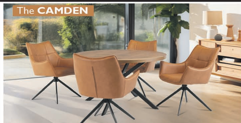
CAMDEN OAK CIRCULAR DINING SETS FROM £699