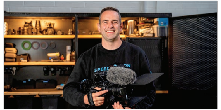
Speed Motion Films in 2013.

He said: "Making videos for the basketball team and uploading them to YouTube is where it started. Soon after I went on to be the Senior Videographer and Editor at Chain Reaction Cycles before setting up