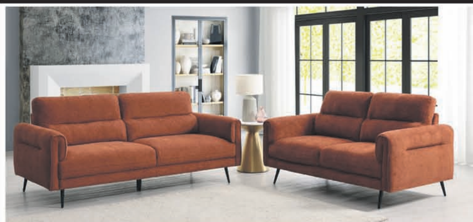
LARGE SELECTION OF FABRIC & LEATHER SOFAS ON DISPLAY

Sizes from 60cmx110cm to massive 240cm x 340cm