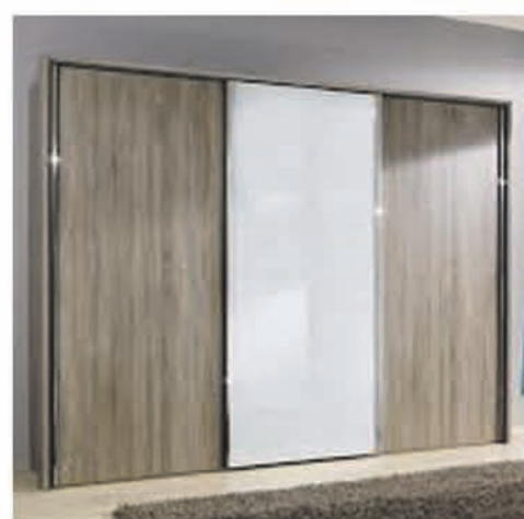
LARGE SELECTION OF SLIDING DOOR WARDROBES FROM £669 FREE ASSEMBLY