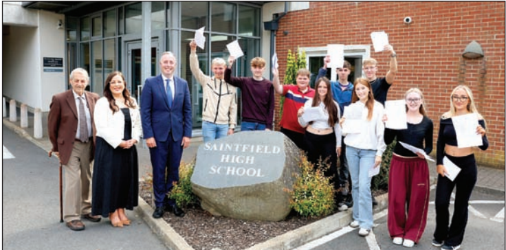
Education Minister Paul Givan pictured with pupils at Saintfield High School.

Results, awarded to over 32,000 GCSE students, reveal that 83.5% of students received grade C/4 and above (82.7% in 2024) while 31.6% received grade A/7 and above (31% in 2024). Commending students during a visit to Saintfield High School, Paul Givan said: "Congratulations to all the young people receiving their GCSE results today. Their hard work and determination have truly shone through in the grades they have achieved. "Pupils in Northern Ireland have once again delivered exceptional results and are continuing to outperform their peers in England and Wales. The percentage of students achieving top grades A/7 and above and those securing C/4 and above, has risen