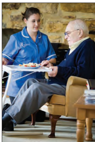
sufficient time or choice about services. There is care yourself. This way, you are in

Traditionally, local care is funded by social services but with on-going budget cuts, many people feel that they do not receive