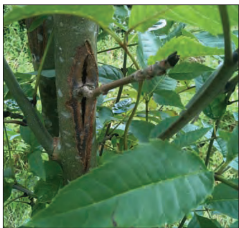
Ash dieback, lesions on the bark

The Trust also asked the public whether they knew of ways to help protect trees and woodland against the risks of tree disease and pests. Thirty-three per cent of the UK respondents and 14 per cent of Northern Ireland respondents stated