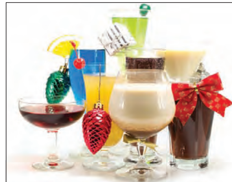
Remember to enjoy those yummy cocktails responsibly during this festive season

6. Had enough of the holidays already? Have a Grinch and feel better.