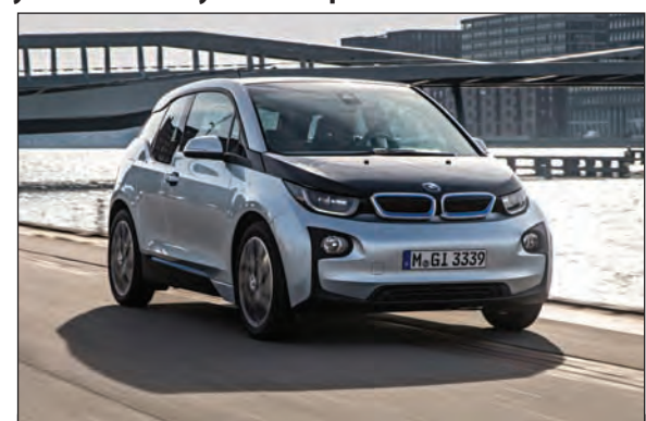
The new electric car from BMW, the i3

Commenting on the BMW i3 The Sunday Times Driving team concluded: "BMW has bided its time while others took their first tentative steps into the electric car market. The brilliance of the i3 comes not in revolutionary battery technology for there is none, but by being a car someone might consider buying for reasons other than it's