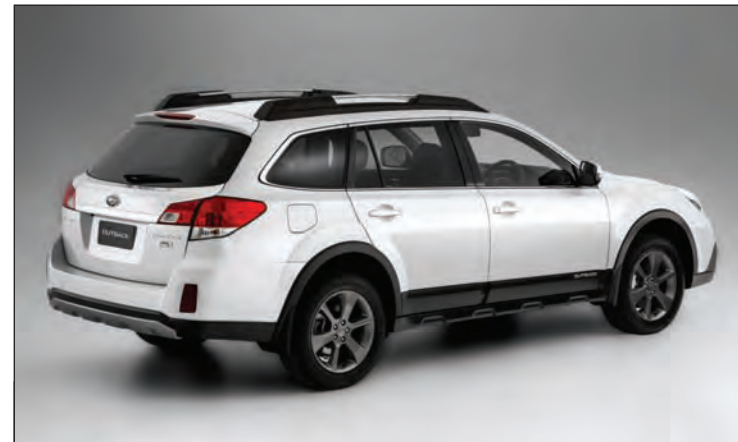
The Subaru Outback

Additional features of leather interior and satellite navigation are available as dealer fit options if the customers wish to upgrade.