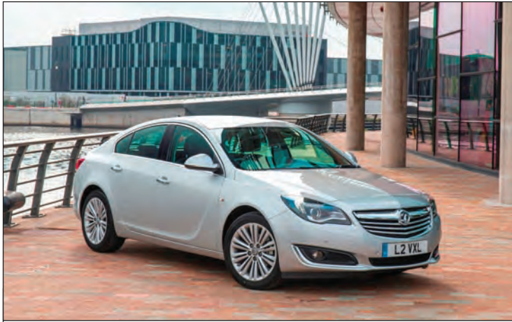
One of Vauxhall's New Insignia Line-Up

Superior as standard The New Insignia range comes with a long list of high-level equipment as standard, including an all-new infotainment system incorporating Bluetooth, alloy wheels and cruise