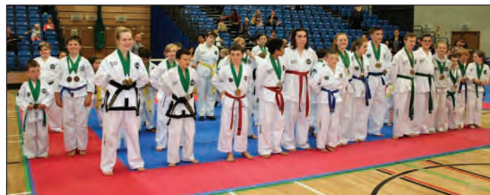
Age and height category trophy awards at The Northern Ireland Junior Taekwon-Do Championships 2013 held in the new Aurora Aquatic Centre, Bangor.

This level of expertise is now being passed on to his current students as his fully qualified instructors are all national team members and dedicated to encourage each child to achieve his or her full potential. For adults, our structured