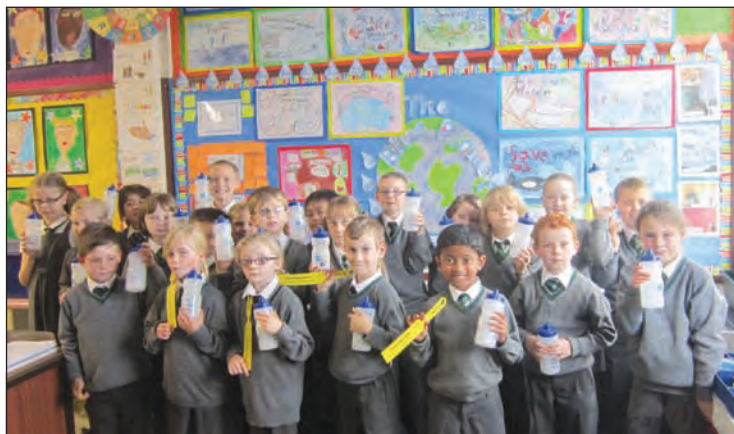
St Malachy's Primary School Bangor recently were paid a visit by NI Water's education team

"We are delighted with the positive feedback we have received from schools who have participated in our education