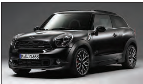
Limited edition Frozen Black metallic paint

The Frozen Black metallic paint finish is created using a complex manufacturing process exclusive to the BMW Group. This special painting process