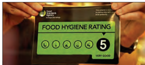
Do you check the hygiene standard of the places you eat?

Down to find out the hygiene standards of the food businesses in the area. Most people would like to think