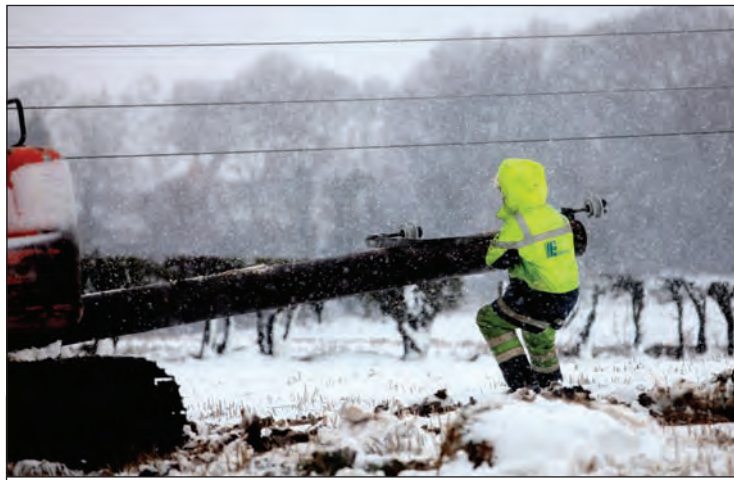
NIE crews out from first light restoring power supplies