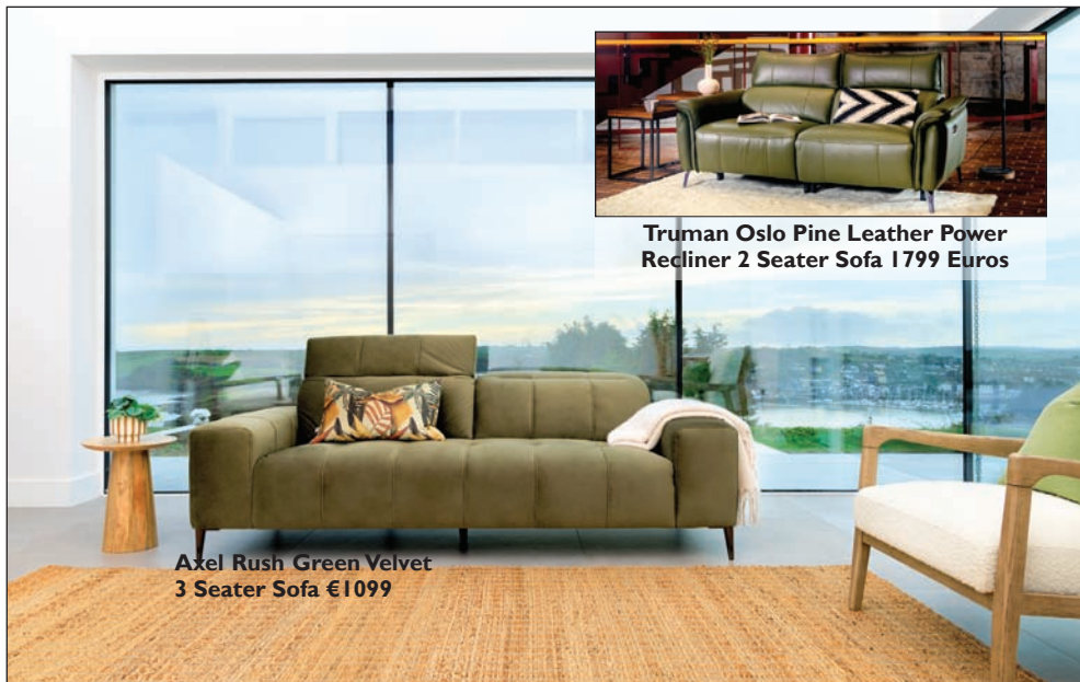
Axel Rush Green Velvet 3 Seater Sofa €1099

Green is transcending its botanical roots to become a versatile neutral. Neutrals create a timeless look, but that does not mean we're confined to only beige, ivory, taupe and grey.